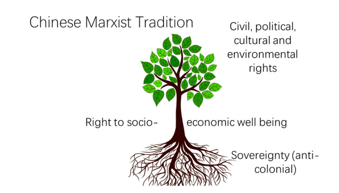
Figure 2. The (Chinese) Marxist approach to human rights.

the master.<sup>3</sup> A specific term was coined (111 BCE) to designate this new concept: dominium , derived from dominus , or master. I cannot emphasise enough that the origins of the Western liberal idea of private property are inescapably connected with slavery in its origins. The breakthrough had immense repercussions. As Graeber observes: